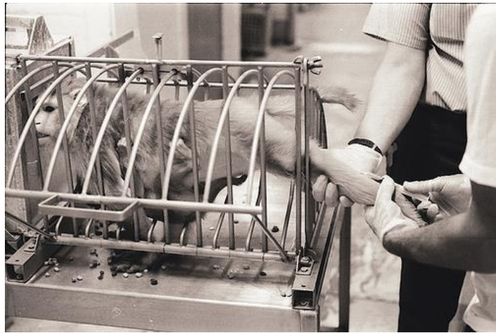
Figure 3: Macaques show behavioral and physiological stress reactions to being removed from the familiar home environment and being forcefully restrained/immobilized during handling procedures. Here, a mother macaque with a baby clinging to her belly is injected while in a squeeze cage (note vertical bars).

Handling is typically stressful for animals confined in laboratories, where many handlings are accompanied by aversive events such as an injection, a blood collection, or forced-feeding (Balcombe et al. 2004). Handling events such as being moved to another cage, or being weighed often cause significant increases of 200% or more in blood levels of the “stress hormone” corticosterone in rats and mice (ibid). Heart rates of six rhesus macaques increased 46% from resting rates in response to a cage change, and remained elevated for two hours after the intrusion (Line et al. 1989). Growth hormone, which may be influenced by many factors including stress, increased abruptly in two of three female rhesus macaques in response to room entry by unfamiliar persons, and in all three monkeys in response to the onset of a telephone ringing (Meyer & Knobil 1967).