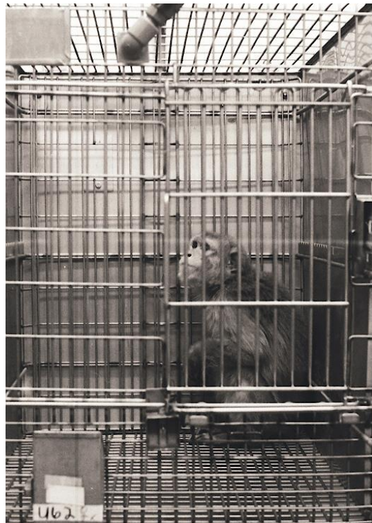
Figure 4: Social isolation is arguably the greatest hardship of all for highly social primates in labs. This hardship is exacerbated by chronic lack of stimulation and frequent painful and/or stressful events.