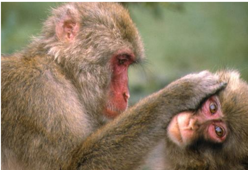
Figure 5: Physical contact, such as grooming, is an important social lubricant in primate societies.

Being caged without others is a harder fate. Single housing is known to cause prolonged stress, anxiety, psychological disturbance, and suppressed immunity in social primates (Lilly et al. 1999, Balcombe et al. in press). Single housing also restricts or curtails physical contact with others. Grooming, for example, is an important social lubricant and general wellbeing-enhancer. Some primate species, including macaques and baboons, spend between ten and twenty percent of their time grooming one another (Dunbar 1988). The International Primatological Society (IPS) stipulates that "single caging on experimental grounds should always be avoided if possible," and that it "should be for as short a time as possible" (IPS 2007, p 16). The USDA Code of Federal Regulations stipulates that housing "must include specific provisions to address the social needs of nonhuman primates of species known to exist in social groups in nature" (USDA 2008, p 108).